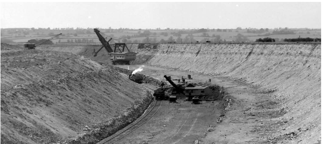
Figure 1. Extraction of iron ore from the Northampton Sand Formation at Irchester in Northamptonshire in 1945. Mesozoic-age sedimentary iron ores were a vital and secure resource during two World Wars. Image © NERC.

The Industrial Revolution in the 18th and 19th Century was the driving force behind the rapid growth in output from the British extractive sector at this time. By the mid 19th Century, Britain was a minerals superpower producing nearly 50 per cent of global copper output (British Geological Survey, 2012). At the beginning of the 20th Century, mined coal output from Britain was almost 300 million tonnes per annum (British Geological Survey, 2012). Demand for domestic minerals was driven by rapid population growth and the growth in a middle class with more consumer spending power in both Britain and her colonies. This instigated rapid expansion in construction and manufacturing, much of it powered by steam raised by burning coal. As well as creating demand for metals and minerals, technological change also improved supply by expanding the resource base. Steam-power allowed access to resources such coal and base metals through de-watering. New metallurgical processing technologies allowed different and lower-grade ore types to be utilised.