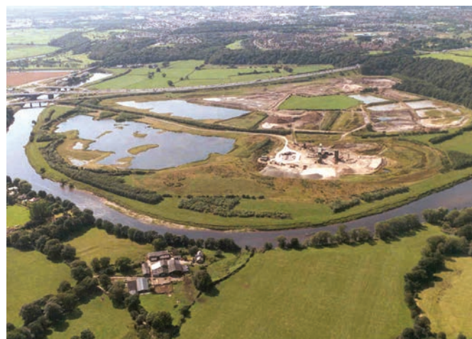
Figure 3. Aerial view of Brockholes Quarry near Preston, 2002.

Brockholes Nature Reserve is a recently restored former sand and gravel quarry approximately 4 km east of Preston (Figure 3). Planning permission for sand and