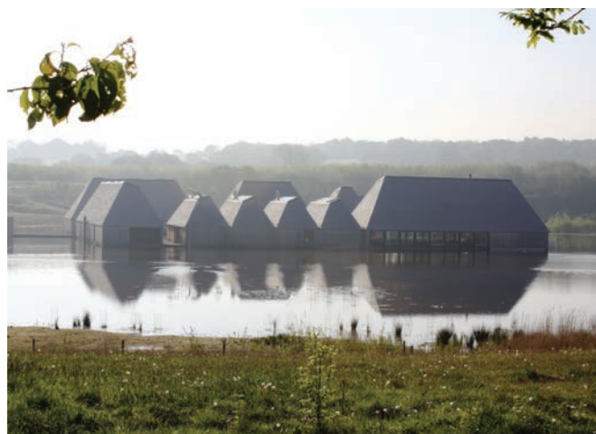
Figure 4. Photograph of the Brockholes Visitor Centre, Preston in 2012. The design of the buildings is based upon the concept of a marshland village and was the winning entry of a competition.

Full planning permission was granted in 2011 for the development of a visitors centre at the site including a cafe unit, retail conference and exhibition spaces. The location and design of the centre was the result of an architectural competition run by Royal Institute of British Architects (RIBA). The concept for the design 'A Floating World' is based upon a cluster of buildings to resemble an ancient marshland village and which are constructed on a floating pontoon on the edge of one of the lakes (Figure 4). The scheme also involves the restoration of the wetlands, and ancient reed bed habitats, the creation of ponds, seeding of meadows, planting new hedgerows and trees, making access paths and building proper bird watching hides. The project has been made possible through a variety of funding measures including an £8.6 million regeneration grant from the North West Regional Development Agency and Natural England and Department for Environment Food and Rural Affairs' (DEFRA) Aggregates Levy Sustainability Fund which awarded around £300,000. The scheme since its opening has scooped several awards including, Sustainable Project of the Year in the 2012 Building Awards.