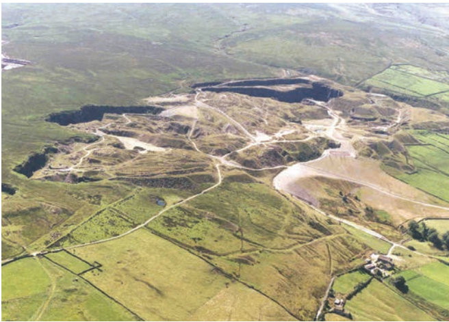
Figure 5. Aerial view of Lee Quarry, near Bacup, Rossendale, 2002 .

Utilising experts in the design of the mountain bike trails the quarry includes 8km of tough technical mountain bike trails.