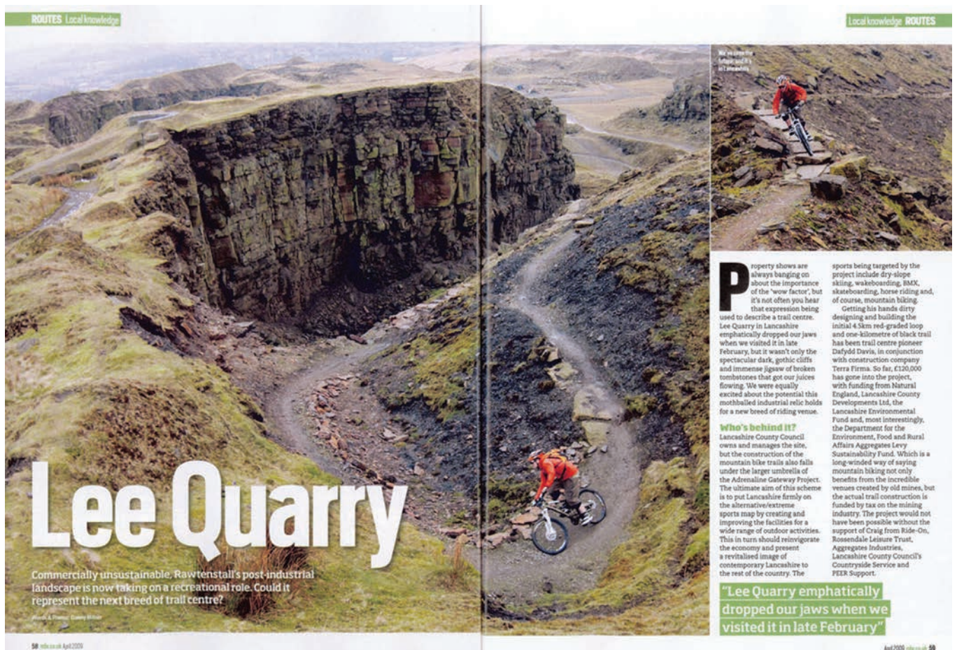
Figure 6. Article from Mountain Bike Magazine showing the restoration of Lee Quarry, Bacup.